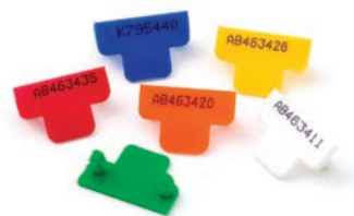
Versapak T Seals