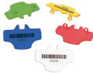
Versapak T2 Seals

Please contact us or visit our website for more information.