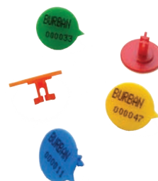
Versapak Button Seals