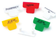
Personalised T Seals