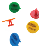
Personalised Button Seals