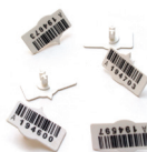
Barcoded Button Seals