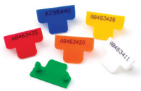
Numbered T Seals

The two-pronged design makes them more secure than other plastic seals on the market. They are available plain, numbered, printed or barcoded, and in a variety of colours. A minimum order of 2 boxes, 1,000 seals applies for numbered/plain and 10 boxes, 5,000 seals applies for personalised/barcoded.